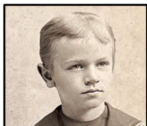
Aldo Leopold, Age 8