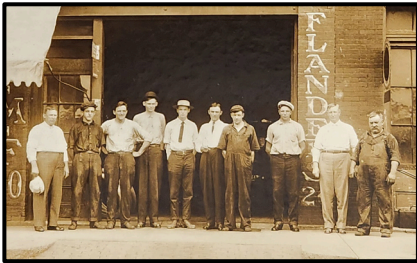
Vaughn Bros. Electric Cars