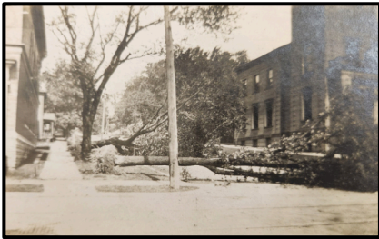
Aftermath of a 1908 tornado at the Library (now Heritage Center)