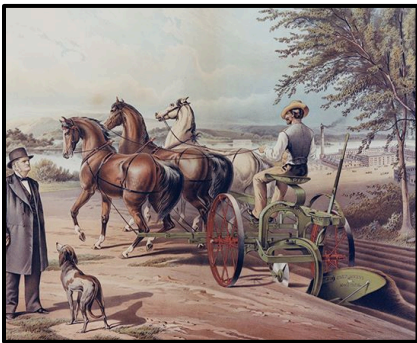
John Deere Demo Painting Of the Sulky Plow