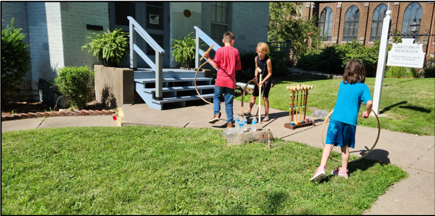
Hoops and Sticks during the Heritage Center Kid's Camp