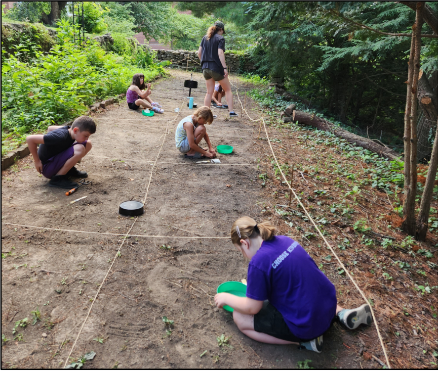
Digging for artifacts during the Heritage Center Kid's Camp