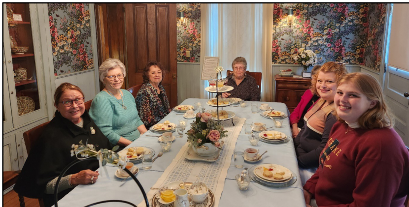
Our guests for the first Garrett-Phelps Tea Time.